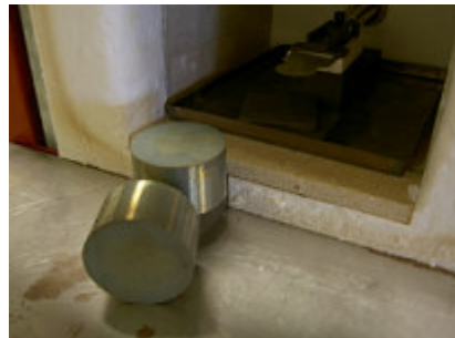
The Inconel 600 sample, with the sensor and sample holder

The main reason for the shorter measurement time and the higher power is that the diffusivity of the brass sample is substantially higher than for the Inconel 600 sample.